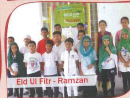
Eid Ul Fitr - Ramzan