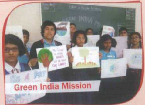
Green India Mission